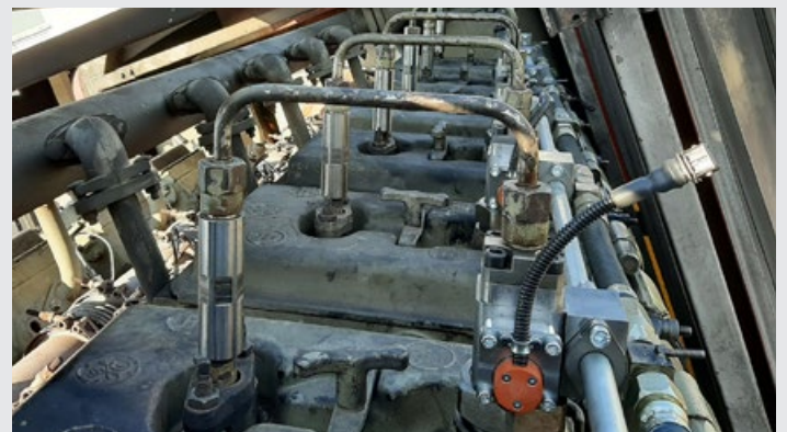
Electronic Pump-Pipe-Nozzle Control (E-PPN)