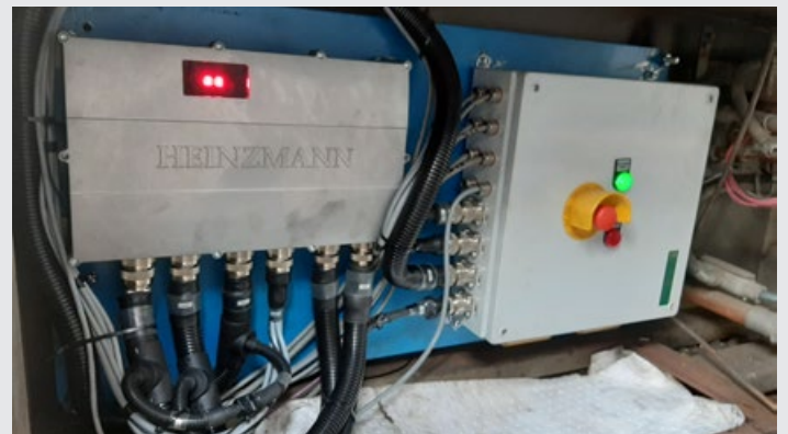
Locomotive Control System (PEGASOS)